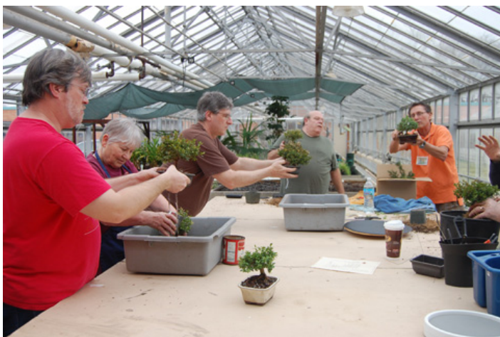
Participants working on trees.